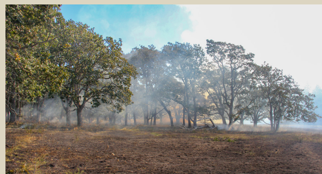
A controlled burn at Rocky Point near Esquimalt, BC. This series shows the landscape before, during and after the prescribed fire.